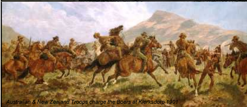
Australian & New Zealand Troops charge the Boers at Klerksdorp 1901