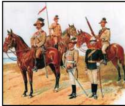
Uniforms & Equipment of the NSW Troops