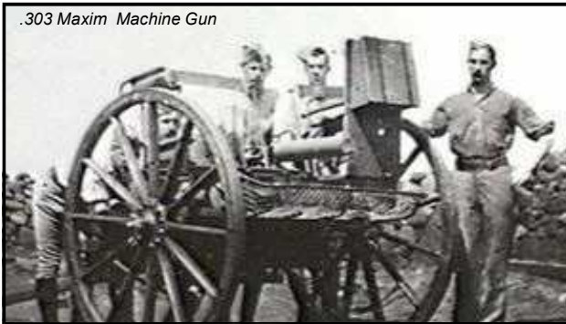
.303 Maxim Machine Gun