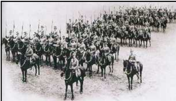
The NSW Lancers...

Britain entered the twentieth century in the grip of war. Between 1899 and 1902, she placed nearly half a million men in the field, the biggest force ever sent overseas throughout her history.