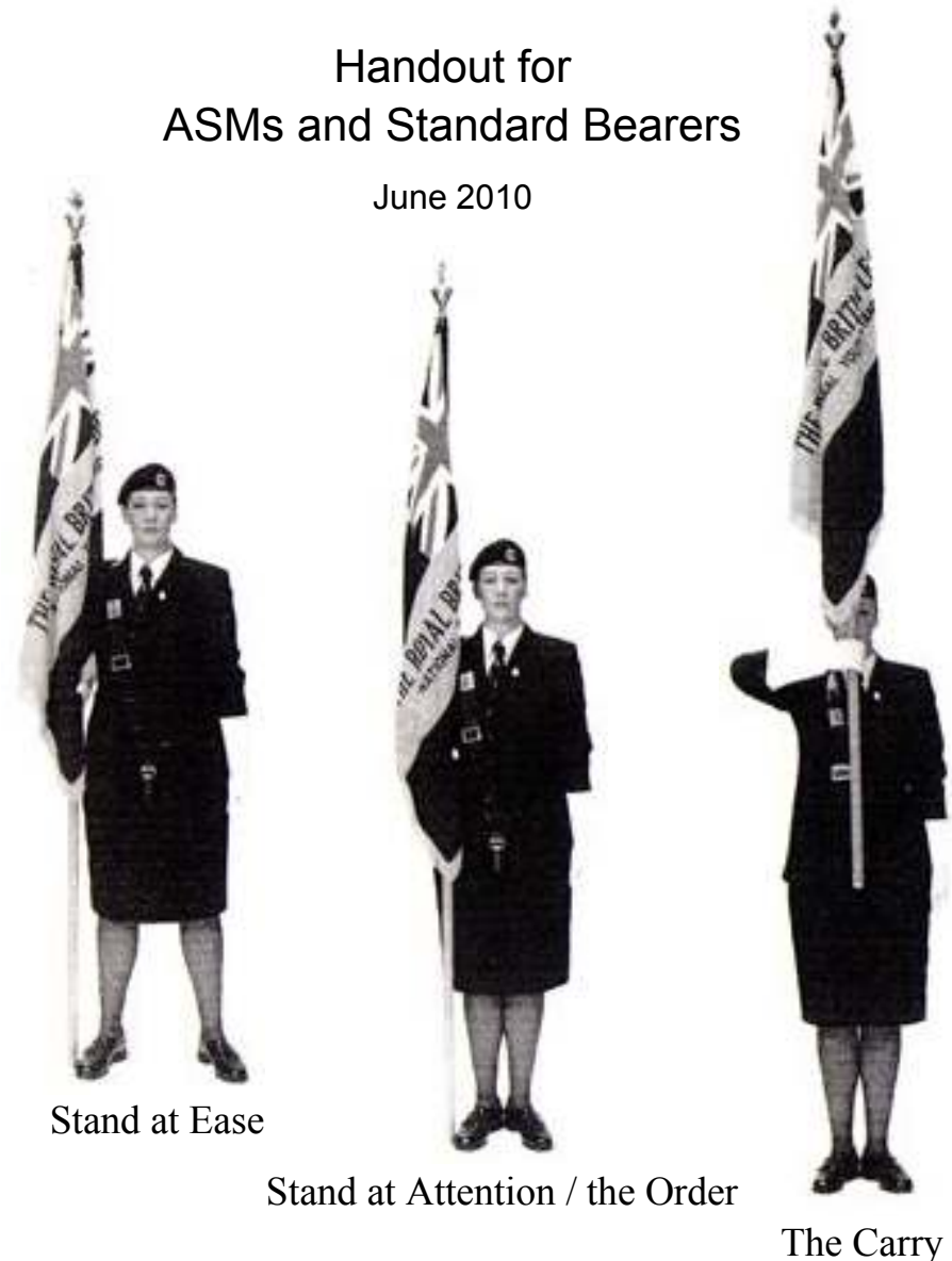
Stand at Ease

Standards Drill and notes are from THE ROYAL BRITISH LEGION "Handbook for Ceremonial and Services".